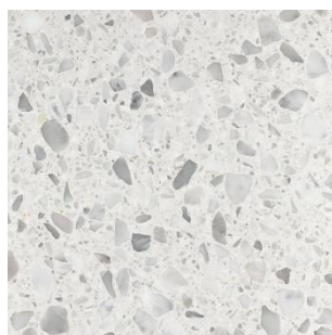
SB 143 BIANCO CARRARA 25