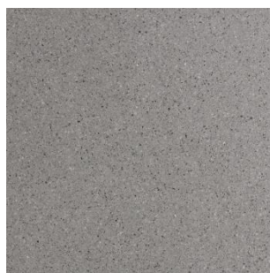
SB 151 ZINCO