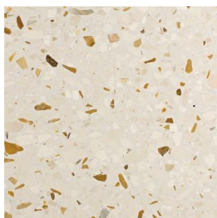
SB 140 CA' D'ORO