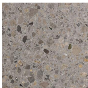
SB 124 GRIGIO ROTONDO