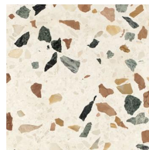
SB 210 MURANO