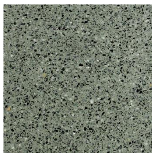
SB 111 VERDE